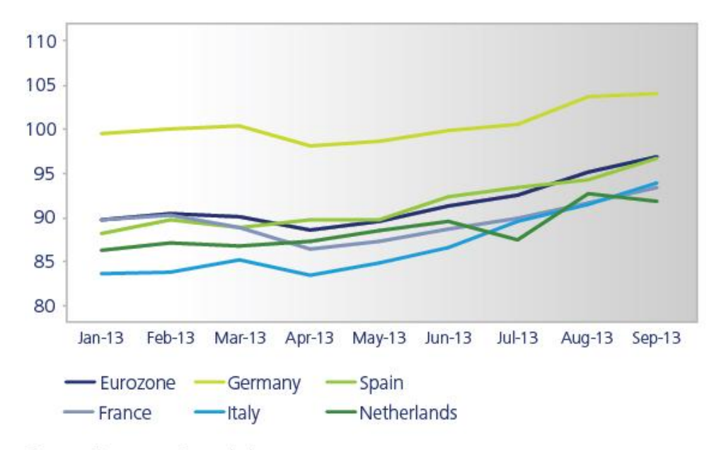
Figure 1. Economic sentiment indicator (ESI)

Deloitte's research indicates that since April, economic sentiment in the Eurozone has improved across the board, coming much closer to the threshold of 100, which separates negative from positive expectations, as shown in Figure 1.